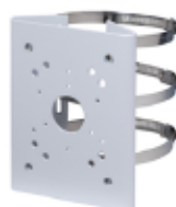
A36 Pole Mount