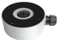
TC-P54AM Spec V4 Junction Box